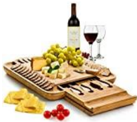
Bambus: Cheese Board and Knife Set