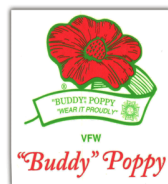
Buddy Poppy Windshield Sticker Code: 09709