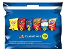
Frito Lay Classis Mix Variety 18 Count

Department, District and VFW Auxiliary Chairmen we must help to spread the word about the amazing opportunity that the National Home offers our nation's military and veterans families. Working together we can make a difference in so many lives. Contact information: Smile.Amazon.com