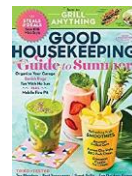
All Types of magazines