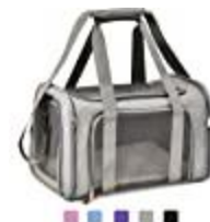
Henkel ion Cat and Dogs Carrier -TSA Airline approved