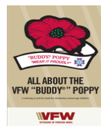
Buddy Poppy Coloring Book Code: 04133