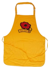
Buddy Poppy Apron Code:07243