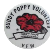
PRODUCT CODE Code: 09705