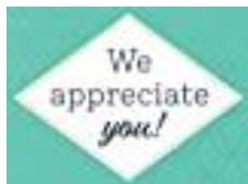
All types of Gift Cards Printed cost $25.00 to $200.00.