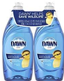
Dawn Platinum -2 Count Pack Dishwashing Liquid