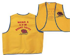
Gold Buddy Poppy Vest Code: 710900