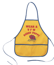
Buddy Poppy Pocket Apron Yellow Code: 07151