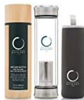
Pure Zen Tumble with Infuser double wall glass travel Tew Mug