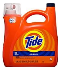
Tide HE Turbo Clean Liquid Laundry Detergent 96 Loads