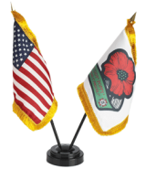
Buddy Poppy 4 x 6" Flag Set Code: 02187