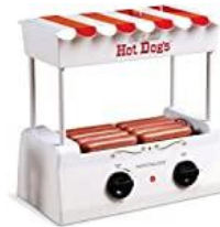
Nostalgia countertop Hot Dog roller 8 reg. size. 6 bun Capacity